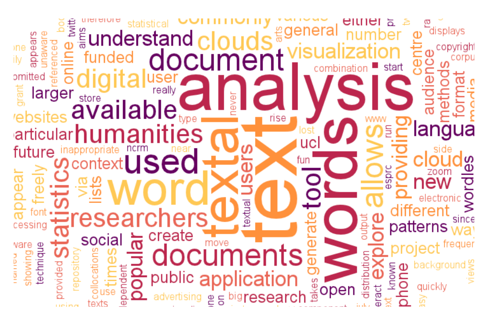
This image is a Textal visualisation of the words in this article. Textal generates statistics for a document, and the largest word in the visualisation - 'analysis' - appears 15 times in this article.

In recent years, Natural Language Processing tools such as Sentistrength<sup>1</sup> have made text analysis more accessible to researchers. This is juxtaposed with popular interest in "word clouds": in 2008 a tool named Wordle from IBM research gave rise to a visualisation that takes a text's most commonly referenced words and displays their size based on the number of times they feature in a particular document. Wordles quickly became used in advertising, on websites, and in print publication, but the problem with this type of visualisation is that the viewer is unaware of the frequency of words behind the word cloud and the raw statistics are lost: Wordles are therefore an inappropriate tool for any kind of serious text analysis.