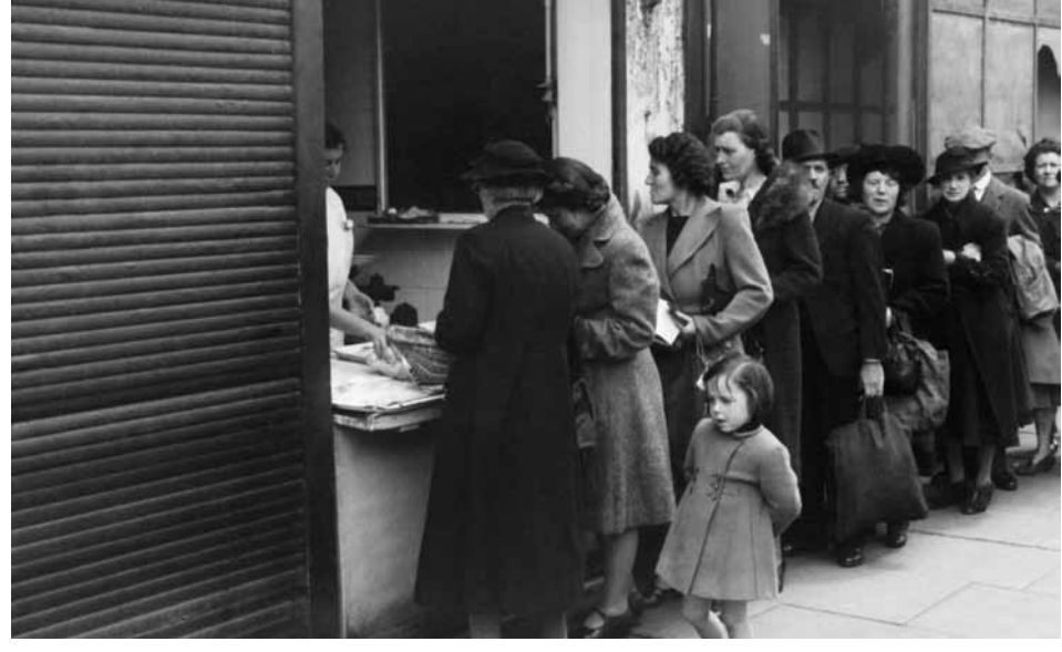
Photo: Men, women and children queue outside a fishmonger in London during rationing and food shortages in 1945.

5 Brettell, CB (1998) Fieldwork in the archives: Methods and sources in historical anthropology in Handbook of Methods in Cultural Anthropology. AltaMira Press, Walnut Creek, Ca. Pp. 513-546