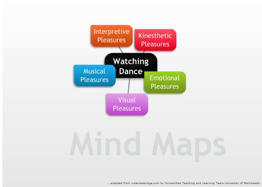
Figure 2. Watching Dance Mind Map – initial interface.