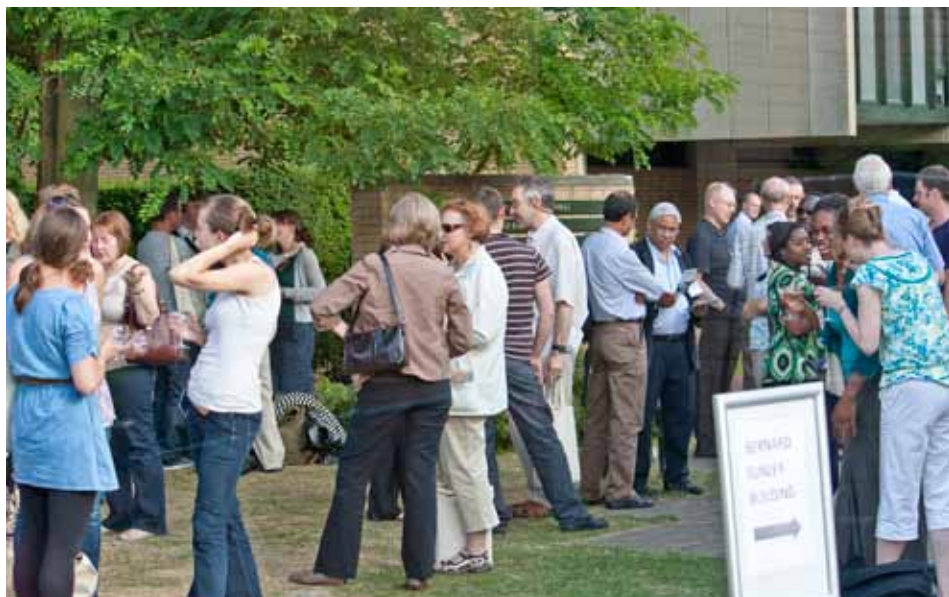
Picture: Festival organisers were lucky with the sunny weather. Here the festival delegates are enjoying themselves at one of the early evening receptions.