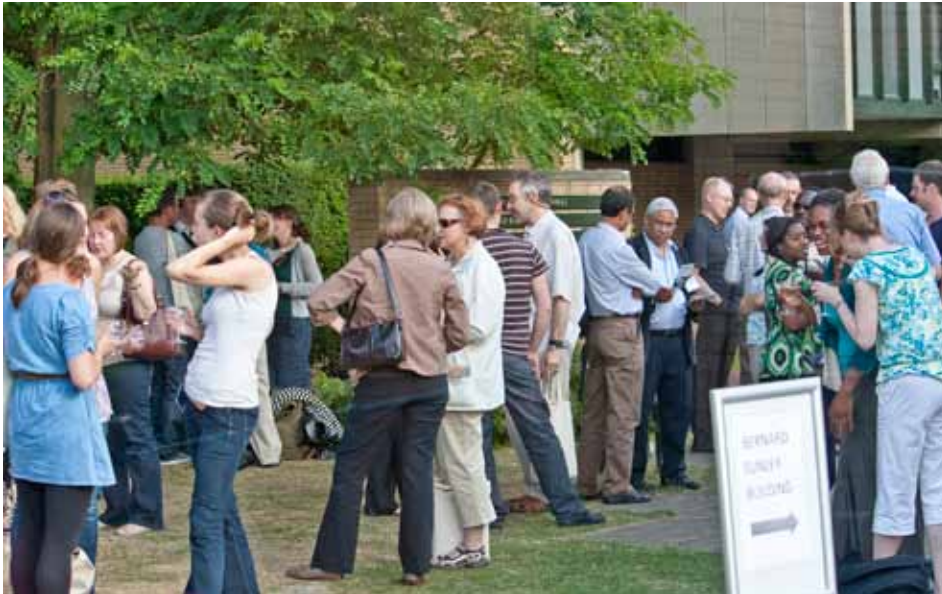
Picture: Festival organisers were lucky with the sunny weather. Here the festival delegates are enjoying themselves at one of the early evening receptions.