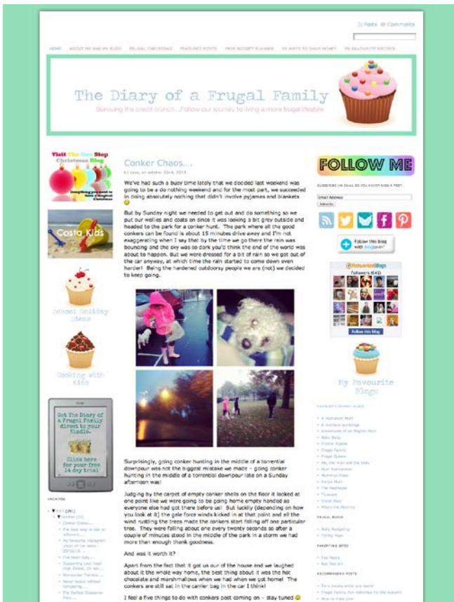
Fig. 1. The Diary of a Frugal Family homepage (Retrieved Oct 23 2013).